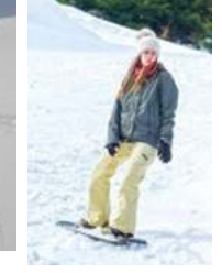
Snowboarding in the Mt Sljeme ski area

https://www.google.co.nz/url?sa=i&url=https%3A%2F%2Fwww.snowshoemag.com%2Fsnowshoeing-in-croatia%2F&psig=AOvVaw0rCjMz_VzHgg0t8lekw0&ust=1699673258974000&source=images&cd=vfe&opi=89978449&ved=2ahUKEwJ89_m3vriCaxUEmMGHHex2AUCr4kDegQJARBO