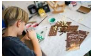
Adults making chocolate bar with various additions and flowers, making pralines, and tasting.

https://www.visitopatija.com/en/chocolate-festival/retropatija-chocolate-experience-mc21