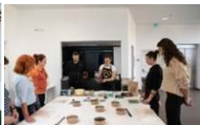
Children decorating chocolate bars

https://www.visitopatija.com/en/chocolate-festival/retropatija-chocolate-experience-mc21