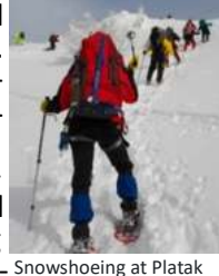
Snowshoeing at Platak

Croatia provides opportunities to ski or snowboard more affordably than many other countries in Europe. In the north, there is usually good snow in the mountains for about 3 months. Mt Sljeme near Zagreb has 4 ski runs, 2 ski-lifts and a triple-chair lift. Platak which is 26km from Rijeka has 7 ski runs and 10 km of cross-country skiing trail. There is also a sledding trail and ice-skating rink and rental options for snowmobiling and snowshoeing so that you can explore the mountainous regions.