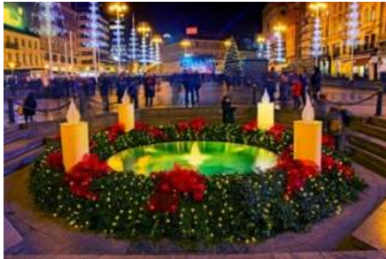
The Mandusevac Fountain in Zagreb's Ban Josip Jelačić Square is decorated with an Advent wreath and candles.

Advent in 2023 is generally from 3 December to 24 December although it can vary from city to city. Year-round tourism is helped along by the numerous advent festivals, fairs, and seasonal celebrations being held all around Croatia. Cities and towns are decked out with beautiful decorations and lights and activities abound with something for everyone - there are ice skating rinks, amusement parks, concerts, sports and educative programmes, special programmes and bus excursions for children, fairs, Christmas trains, cultural events, advent craft, local cuisine.