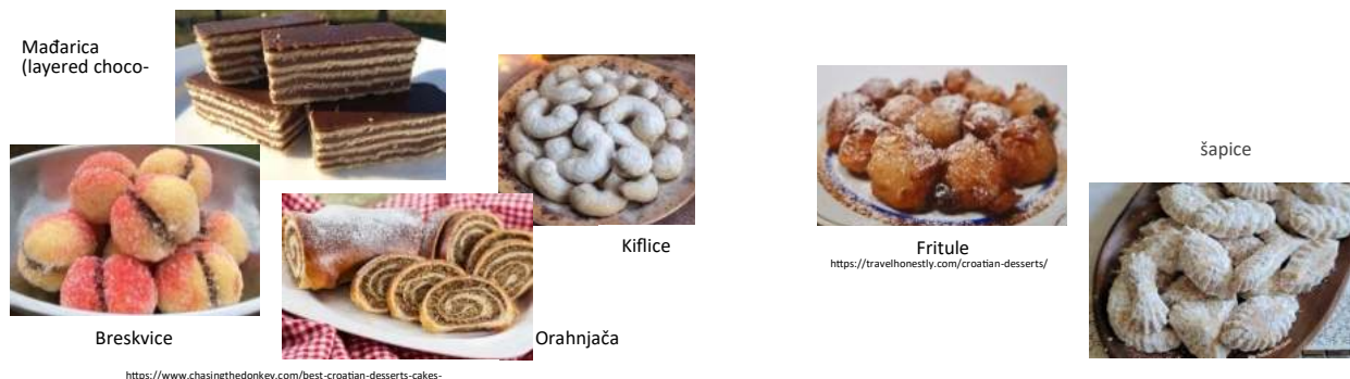
Mađarica (layered choco-)

A selection of sweet dishes which are popular throughout Croatia over Christmas