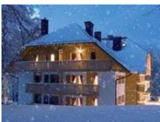
Sljeme ski resort

https://www.google.co.nz/url?sa=i&url=https%3A%2F%2Fcroatia4travel.com%2Fsljeme-ski-resort-zagreb%2F&psig=AOvVaw0rCjMz_VzHgg0t8lekw0&ust=1699674171717000&source=images&cd=vfe&opi=89978449&ed=2ahUKEwInqfrwbiCAxkKStgGHZGTCMMQr4kDegQJARBO